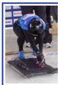
★ Rebecca Sorensen Olympic Alternate for Skeleton